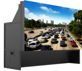
LED Light Source