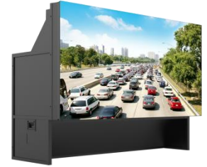
RGB Laser Light Source